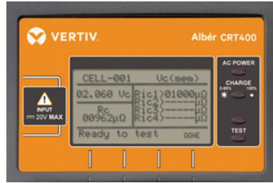
The test screen shows the cell number, internal resistance, voltage and four intercell connections.