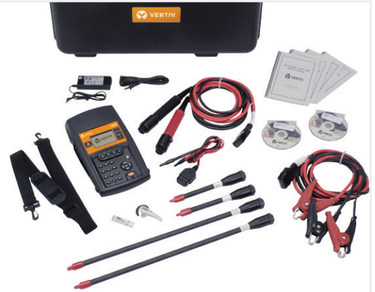
(Shown with optional accessories)