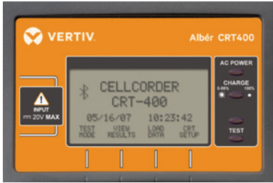
The new graphical display makes it easier to navigate through the menus.