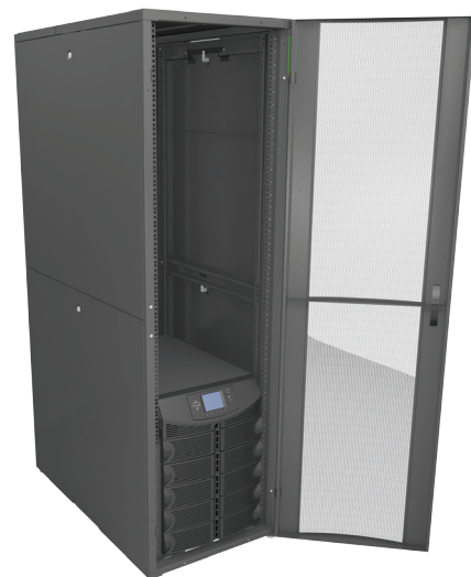
The Liebert APS UPS can be installed on raised floors, traditional flooring, or in rack enclosures.