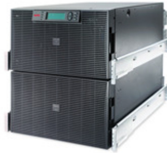
APC Smart-UPS RT 15kVA RM 230V Part Number: SURT15KRMXLI