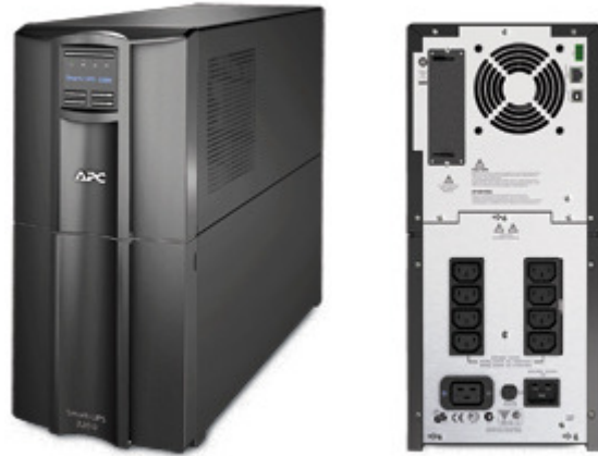
APC Smart-UPS 2200VA LCD 230V Part Number: SMT2200I

Technical Specifications Product Overview Documentation Software & Firmware Options Ratings and Reviews